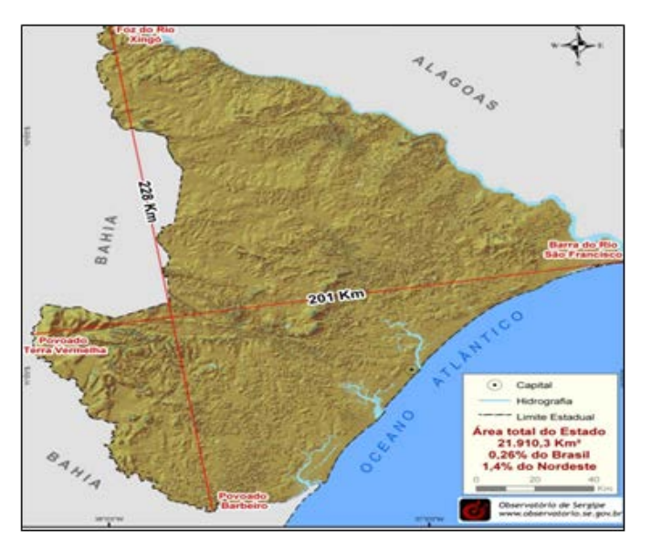
Map 1 – Limits and Extreme Points – Sergipe

Its gross domestic product was R$ 23.9 billion; the highest GDP per capita in the Northeast region equivalent to R$ 11,572.44 (IBGE, 2010). The service sector accounts for 59.7% of GDP, as the industrial and agricultural sectors account respectively for 25.5% and 4.1% of GDP. Taxes on product net of subsidies amounted to 10.7%.